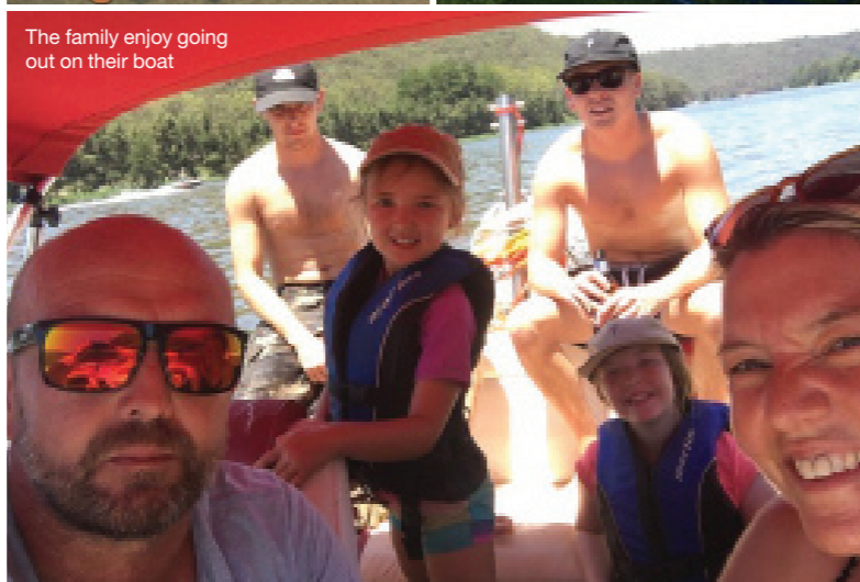
The family enjoy going out on their boat

“We are hardly ever home in the summer as we spend our time doing outdoor activities”