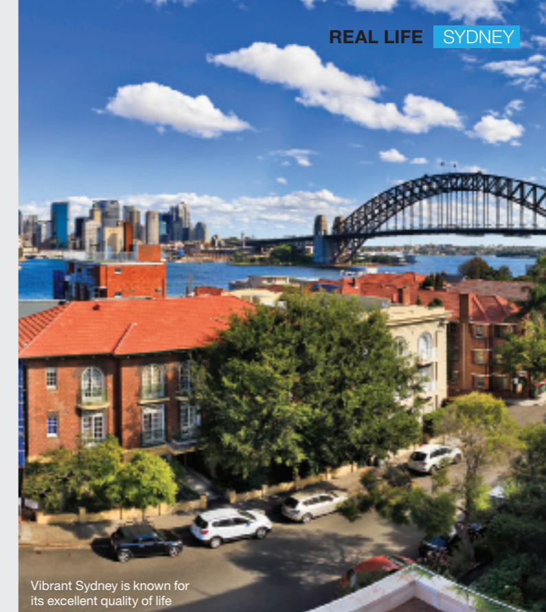
Vibrant Sydney is known for its excellent quality of life

Around 40,000 new people move to Sydney each year and