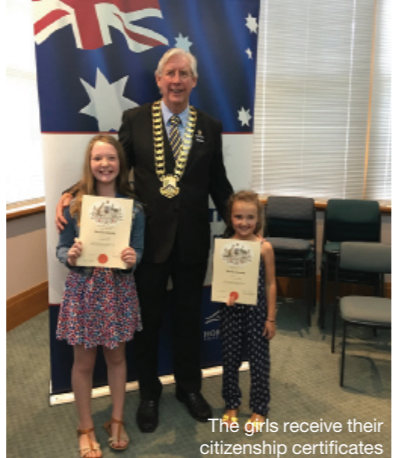
The girls receive their citizenship certificates

We became Australian citizens in 2016 and the citizenship ceremony made me feel very proud and lucky